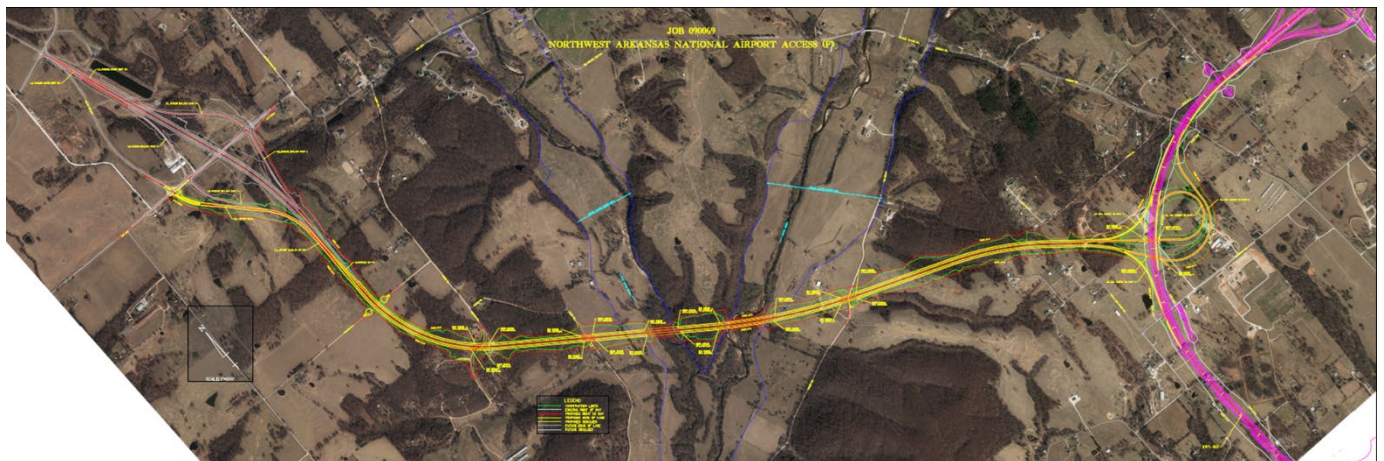
Figure 1: Preferred Alternative

This project will also purchase right-of-way to preserve the area needed for a future diamond interchange with Hwy. 264. When future traffic reaches a certain level, the four-lane divided freeway section of XNA Access Highway will be extended to overpass Hwy. 264 connecting directly with a realigned Airport Boulevard and ramps will be provided for access to and from Hwy. 264. A detailed interactive map is available for review on the project website.